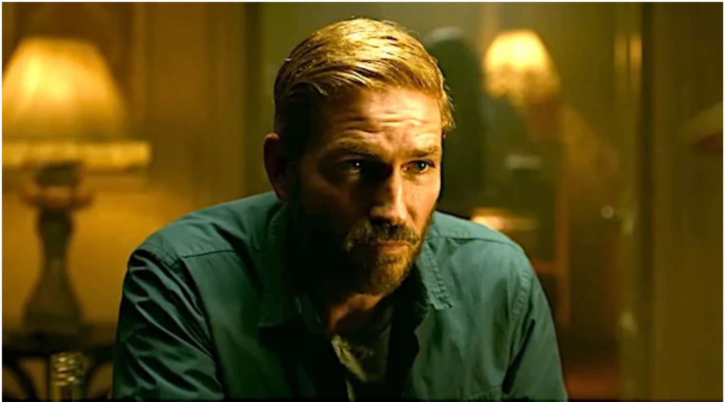
Jim Caviezel starring in 'Sound of Freedom'