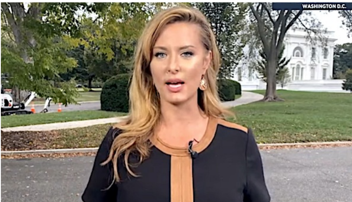
Emerald Robinson (Video screenshot)

"Under the cover of vaccinating people, we are really preparing to tag and track people," Robinson writes.