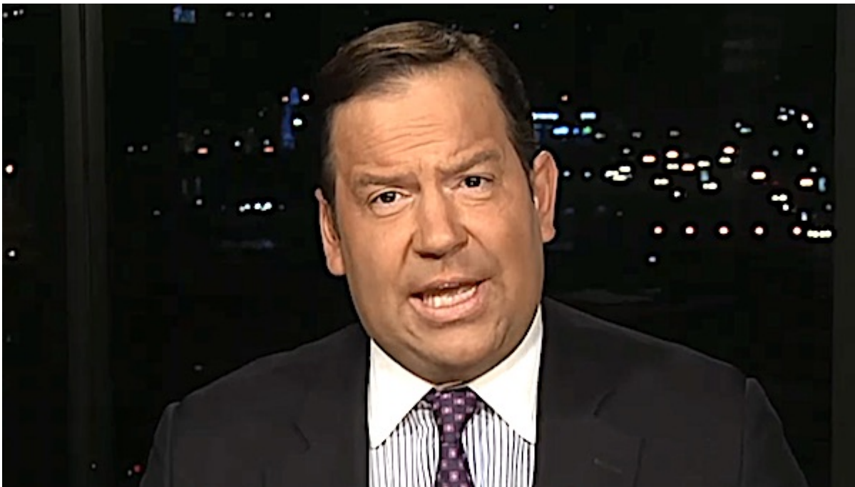
Steve Cortes (Video screenshot)

"No one should be pressured to choose between medical privacy & their job."