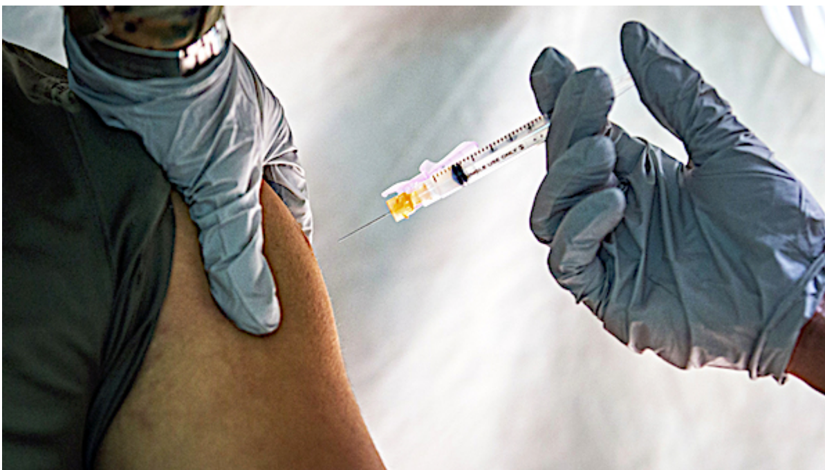
A Marine receives the COVID-19 vaccination at the U.S. Naval Hospital Okinawa at Camp Foster in Japan, Feb. 18, 2020.

Journalists at one news agency have become embroiled in piercing controversy over reports of a company-imposed vaccine mandate and claims by its White House correspondent the COVID shot contains a satanic marker allowing people to be tracked.