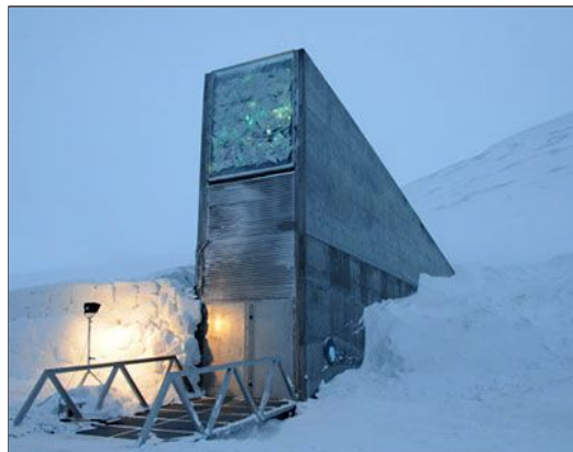
Bill Gates has teamed with the Rockefellers, Monsanto and the government of Norway in the Doomsday Seed Vault, in which organic seed is stored for some vague anticipated world catastrophe.

California was the first State to defy the federal government in de-criminalizing marijuana for medical use, through the 10th Amendment (States' rights).