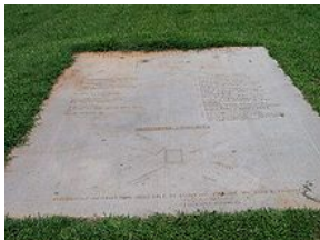
The explanatory tablet, immediately west of the edifice.

A few feet to the west of the artifact, an additional granite ledger has been set level with the ground. This tablet identifies the structure and the languages used on it, lists various facts about the size, weight, and astronomical features of the stones, the date it was installed, and the sponsors of the project. It also speaks of a time capsule buried under the tablet, but the positions on the stone reserved for filling in the dates on which the capsule was buried and is to be opened are missing, so it is not clear whether the time capsule was ever put in place. Each side of the tablet is perpendicular to one of the cardinal directions, and is inscribed so that the northern edge is the "top" of the inscription.